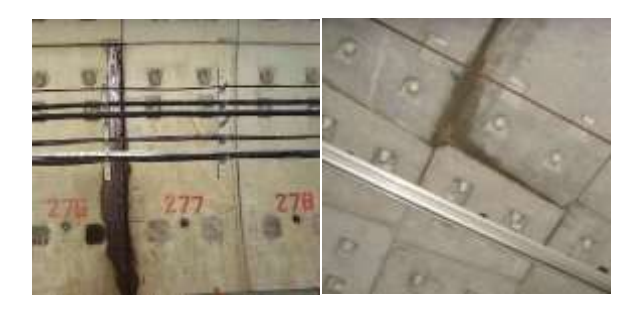
Figure 3: Typical leakage at concrete lining joints of metro tunnels in Shanghai